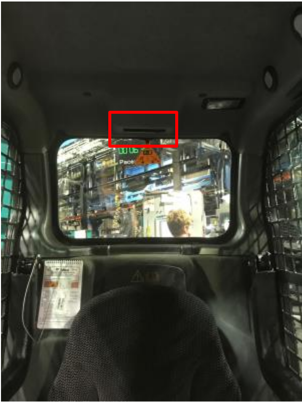
Or behind the cab